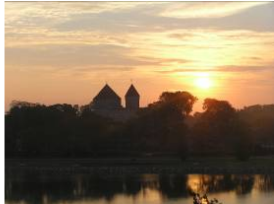
The Bishop's castle and typical house in the capital Kuressaare

The second Project meeting of the EU FP6 Integrated project SENSOR 1 was held in the island of Saaremaa last September. The location for the meeting was chosen because Saaremaa is part of the coastal Sensitive Areas case studies in SENSOR.