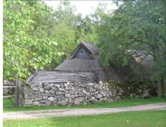
Laidevahe Nature Reserve with mosaic wetland system; peasant house in Kovuga village in Muhu Island

Focusing briefly on the SENSOR project, two years have nearly past and achievements are now becoming clearly visible. Especial for this kind of projects are the integrated methodological developments including the multidisciplinary assessment of People, Profit, Planet issues. Recently the 'topping up' of the SENSOR project was approved; the consortium now includes some Targeted Third Countries: Brazil, Uruguay, Argentina and China. We will meet the new partners in the next Cluster meeting in Vienna in April 2007.