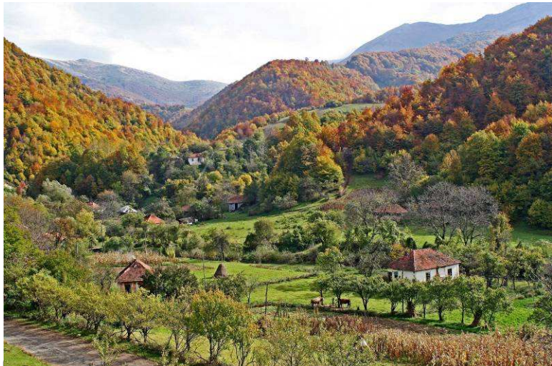
„Manifold structured landscape in the Stara Planina at the Serbian-Bulgarian Green Belt“

Against the background of the cultural and economic aspects of this “involuntary wilderness”, the exhibition will show the biological and cultural diversity from sub-Arctic Lapland and the Baltic coast to the central European low mountain ranges and flood plains to the Black Sea coast and the Bulgarian-Turkish border. Diversity is the keyword, both in the scope of the project and the regions it traverses. The aspects covered range from delicacies of the far north such as reindeer meat and cloudberries to amber on the Baltic coast and the magnificent flora of the Balkan Mountains. Exhibits from the different regions allow visitors to discover the diversity of landscape, culture and natural habitats for themselves. Finally it will consider the possible future development of these border regions in the heart of Europe. An exhibition text book, film screenings and a workshop (in collaboration with the International Association of Landscape Ecology IALE 2009 in Salzburg) will round off the programme.