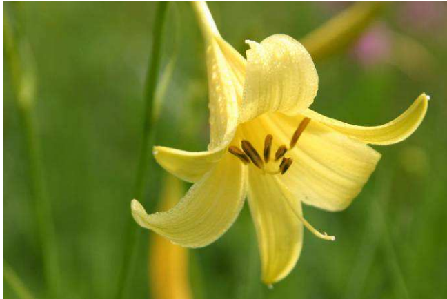
“Yellow Daylily (Hemerocallis lilioasphodelus) – a preciousness of the Green Belt,”